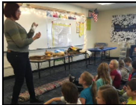
The 4th graders had a visit from a guest speaker from the Wisconsin Historical Society recently who presented replicas and artifacts from the Native American time era.